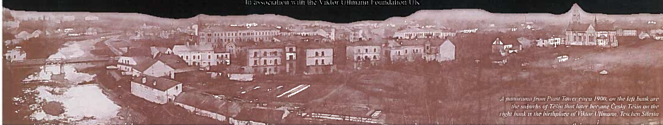
A panorama from Piast Tower circa 1900, on the left bank are the suburbs of Těšín that later became Český Těšín on the right bank is the birthplace of Viktor Ullmann, Teschen Silesia

In association with the Viktor Ullmann Foundation UK